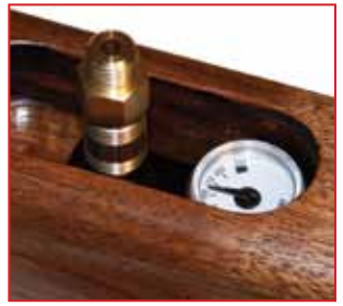
Windy City fill port & adapter shown above.

2) When charging is complete, bleed the excess air using the bleed screw on your fill device and remove the adapter from the rifle.