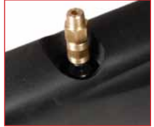
Monster fill port & adapter shown above.