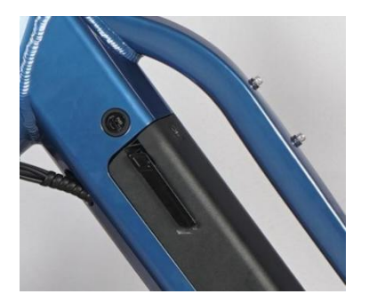
Locking and Turning Battery On/Off