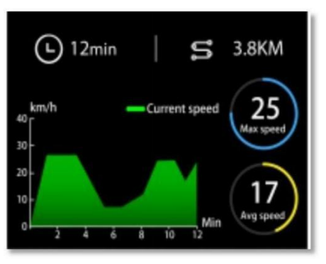
Data Statistics Interface

NOTICE: The maximum statistical time range of linear statistical chart is three hours, and the timing will start again after three hours.