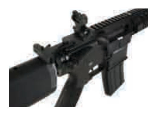
Step 1 . To access the Hop Up Unit pull back the Charging Handle. The Charging Handle has a latch on the left side. Please be gentle when pulling back.

The Hop Up Unit adds a back spin to the BB to allow a longer flight path. Before use please do so in a safe location and make sure nobody is behind the target. When using different weight BBs you will have to make adjustments. When not is use please turn the Hop Up Unit off.