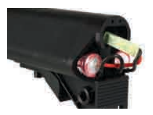
Step 3. Slide the battery into the crane stock and tuck the fuse and plug back into the metal tube.