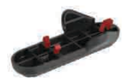
CAUTION: Please be gentle when removing the stock pad. The highlighted red parts can be broken if abused. The warranty does not cover abuse.