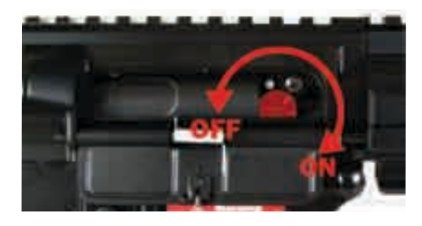
Step 2 . Hold the Charging Handle back to open the Hop Up area and make adjustments.

Step 3 . To adjust the hop up unit you will have to turn the wheel. Turning UP will add more hop up effect and turning DOWN will turn the hop up unit off. Once you find the best setting you can release the charging handle.