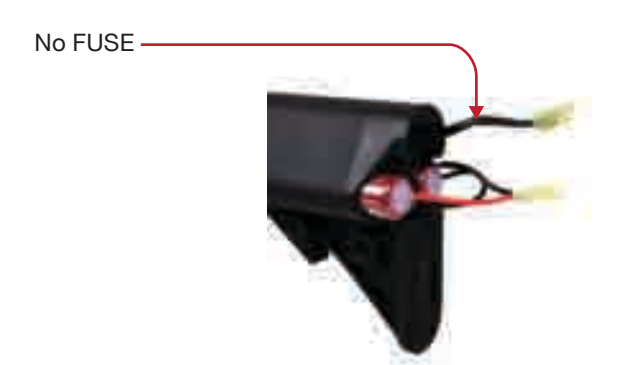
Step 2. Insert the battery cells on either side of the crane stock. Gently pull out the wire to expose the fuse and for easier plug connection.