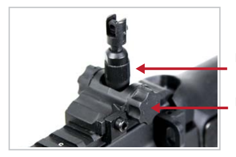
Knob to adjust height

Press the button then move sight up or down.