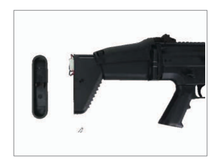
Step 5. Once the battery, wires and fuse is tucked into the stock you can install the butt pad. Press the butt pad onto the back and press the stock pin back through the holes to secure the pad onto the gun.