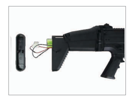
Step 4. Slide the battery and wires into the stock. The battery will slide all the way in even when the stock is on the shortest position.