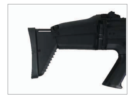
Step 1. Gently push the stock pin to the side. The stock pin is held in the stock by a small metal clip. With too much force aplied to the stock pin the clip will become disconnected. Do not lose the stock pin and clip.

Divide the battery output by the charger output to get the estimated charge time for different battery / charger combinations.