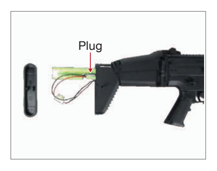
Step 3. The custom battery has an empty spot which is for the plug. Please plug the battery in and place the wires as shown.