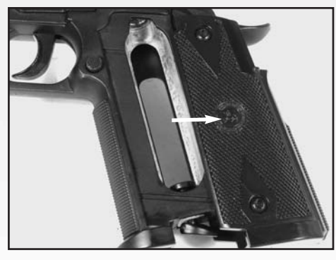
• Slide the grip backward to open the cartridge compartment.