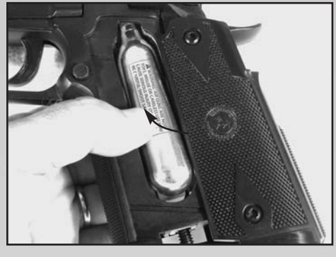
• Insert the cartridge and first, take care to perfectly center it at the top.