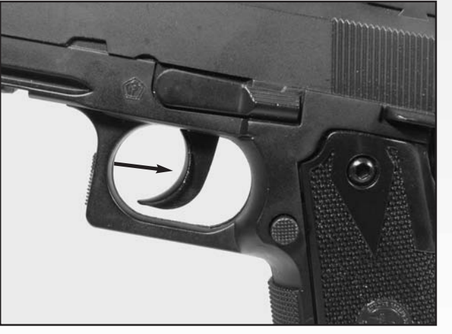
• Pull the trigger