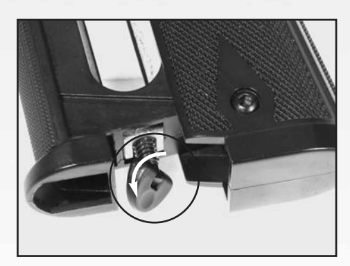
Unscrew this button to introduce easily the cartridge.