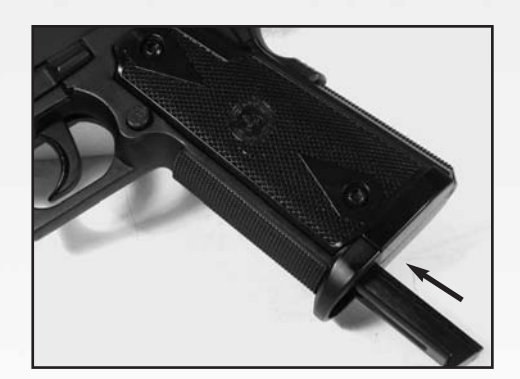
• Slide the magazine in the grip until it is locked (a distinct click will be heard).