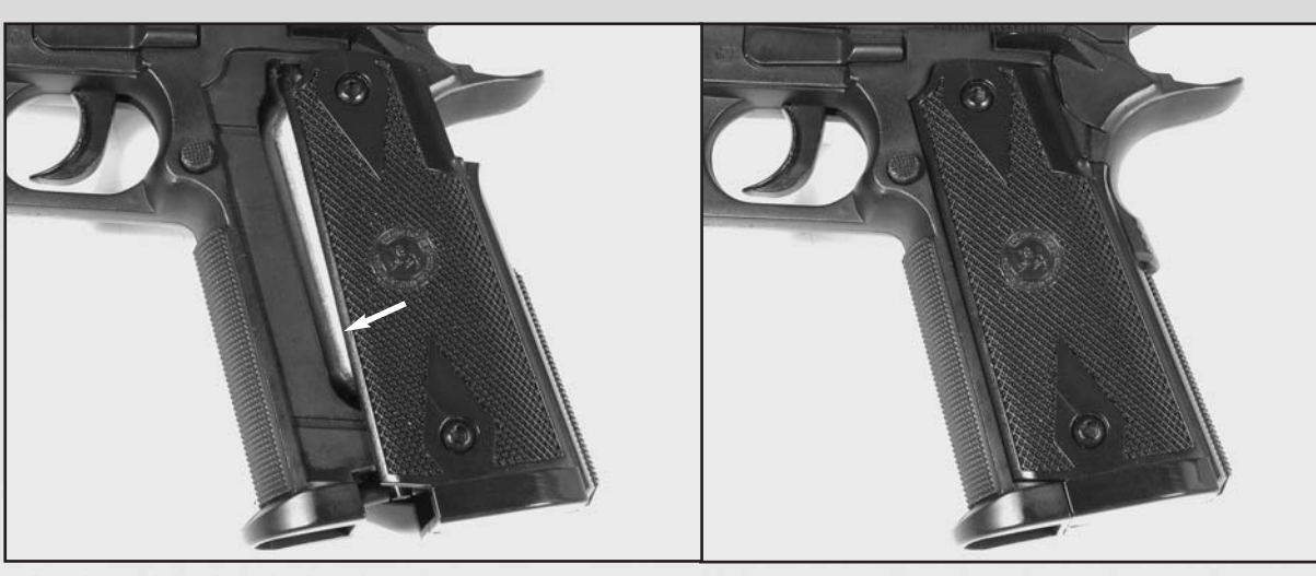
• Push and lock grip in place.