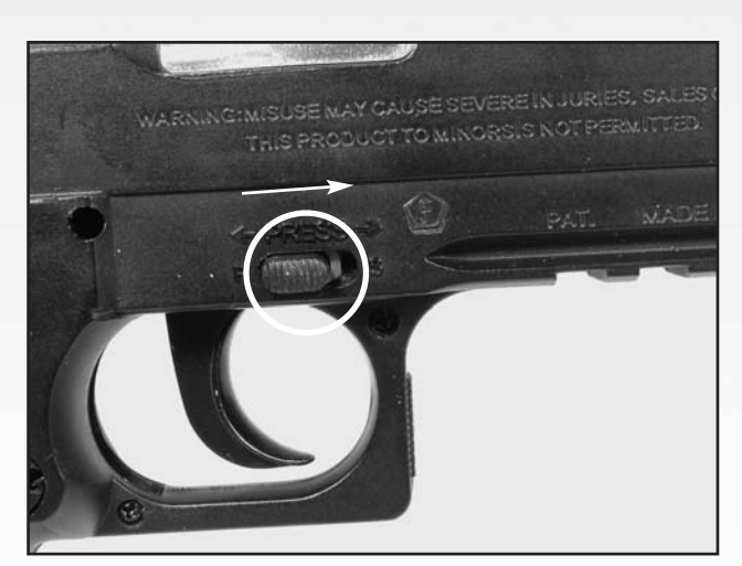
• After emptying the magazine, press and at the same time push the safety mechanism back into the locked position.