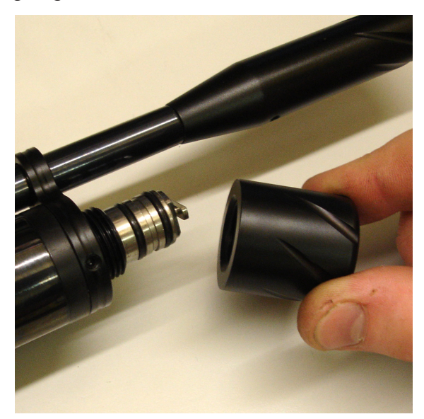
This is achieved by unscrewing the cover in an anti-clockwise direction.

First the female part of the filling kit (this was supplied with the rifle) must be fitted to your filling equipment. The female part (S475) has a 1/8th BSP male thread that screws directly into the hose of your pump or bottle. Next remove the dust cover from the end of your rifle.