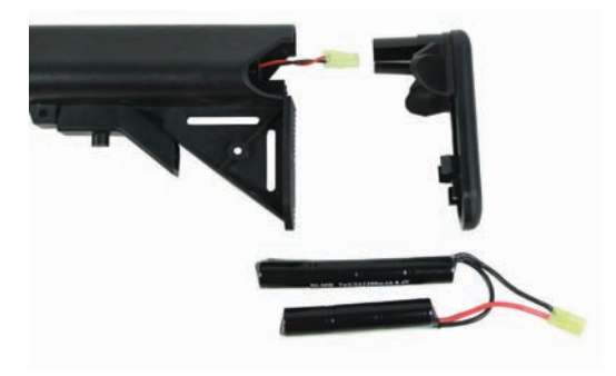
Step 2. Insert the battery cells on either side of the crane stock. Gently pull out the wire to expose the plug for connection.