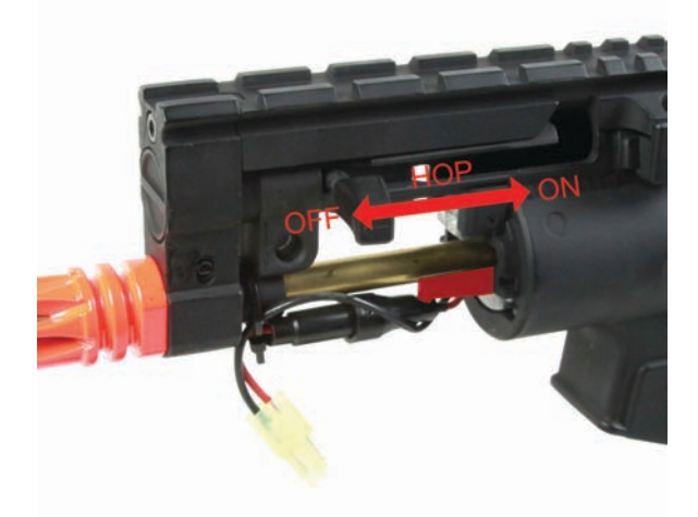
Step 2. To adjust the hop up unit you will have slide the bar back or forth. Adding UP will add more hop up effect and turning OFF will turn the hop up unit off. Once you find the best setting you can install the hand guard.