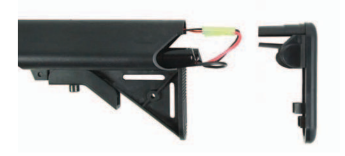
Step 3. Slide the battery into the crane stock and tuck the fuse and plug back into the metal tube.