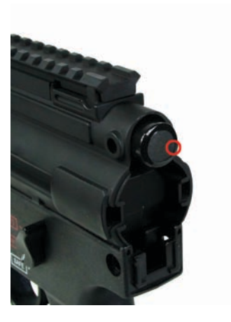
Step 3. Slide the stick battery all the way into the gun. Make sure the wire spine is on either side on bottom side for correct install. You might have to use a tool to pull the plug out the other end.