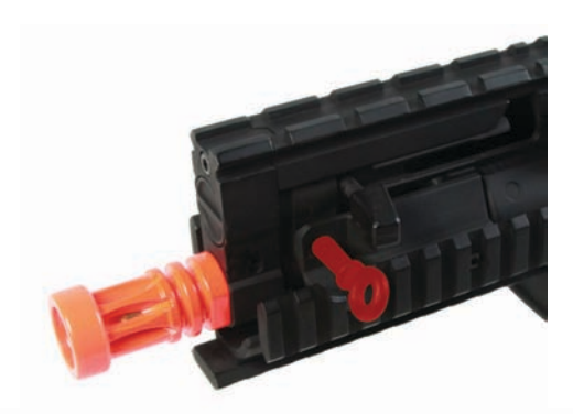
Step 1. To access the Hop Up Unit you will have to remove the Hand Guard pin and the Hand Guard.

The Hop Up Unit adds a back spin to the BB to allow a longer flight path. Before use please do so in a safe location and make sure nobody is behind the target. When using different weight BBs you will have to make adjustments. When not is use please turn the Hop Up Unit off.