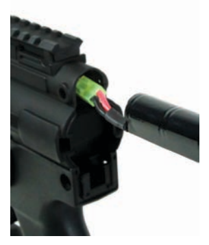
Step 2. To insert the 9.6v stick battery first straighten the wires if needed. Notice the wire along side the row of battery cells. Keep the wire or spine to the bottom left or right as you slide the battery into the gun.