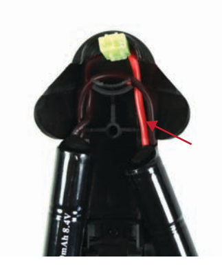
Step 4. To attach the stock pad you will need to reverse the steps. Press in on the top tab and pivot inward. Gently press on and make sure not to damage any parts. Please notice the wires going through the slots in the stock pad for correct install.

CAUTION: Please be gentle when removing the stock pad. The parts can be broken if abused. The warranty does not cover abuse.