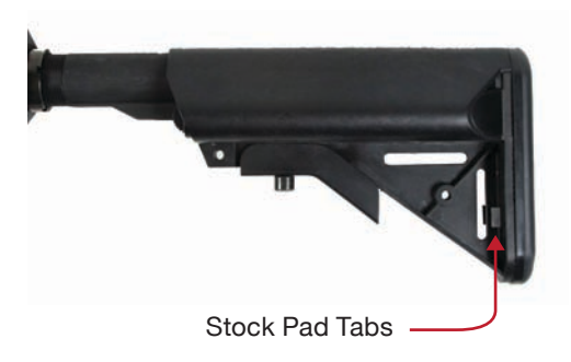
Step 1. Gently press inward the two tabs on the Stock Pad. About 2mm and should be clear. Pull back on the stock pad to remove.