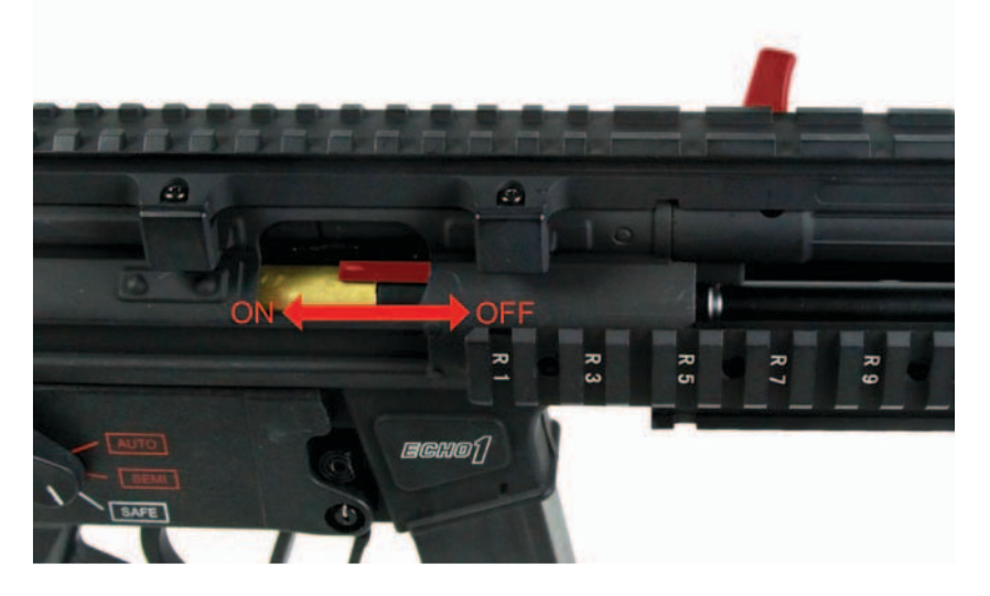
Step 2. To adjust the hop up unit you will have slide the bar back or forth. Adding UP will add more hop up effect and turning OFF will turn the hop up unit off. Once you find the best setting you can release the charging handle.