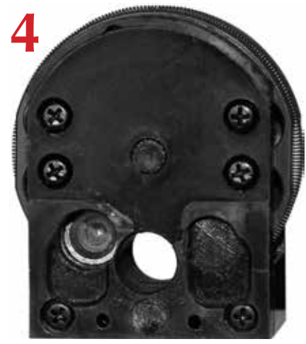
4: First pellet has been inserted & properly seated.