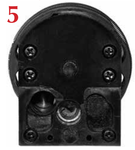
5: After seating pellet, turn mag so pellet appears in center hole and left hole is ready to accept another pellet. Repeat steps 1-5 until mag is filled.

.177-cal. mags are 10mm deep .22-cal. mags are 10mm deep .25-cal. mags are 10mm deep 9mm mags are 11mm deep