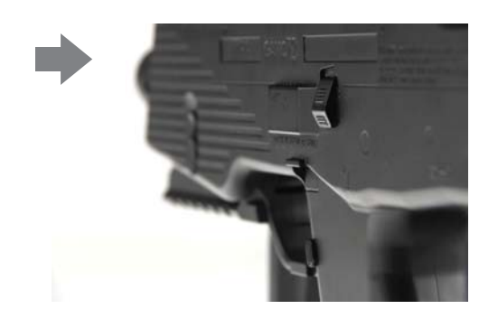
FIRE. Safety Mechanism OFF

Press the button leaving the red warning mark visible.