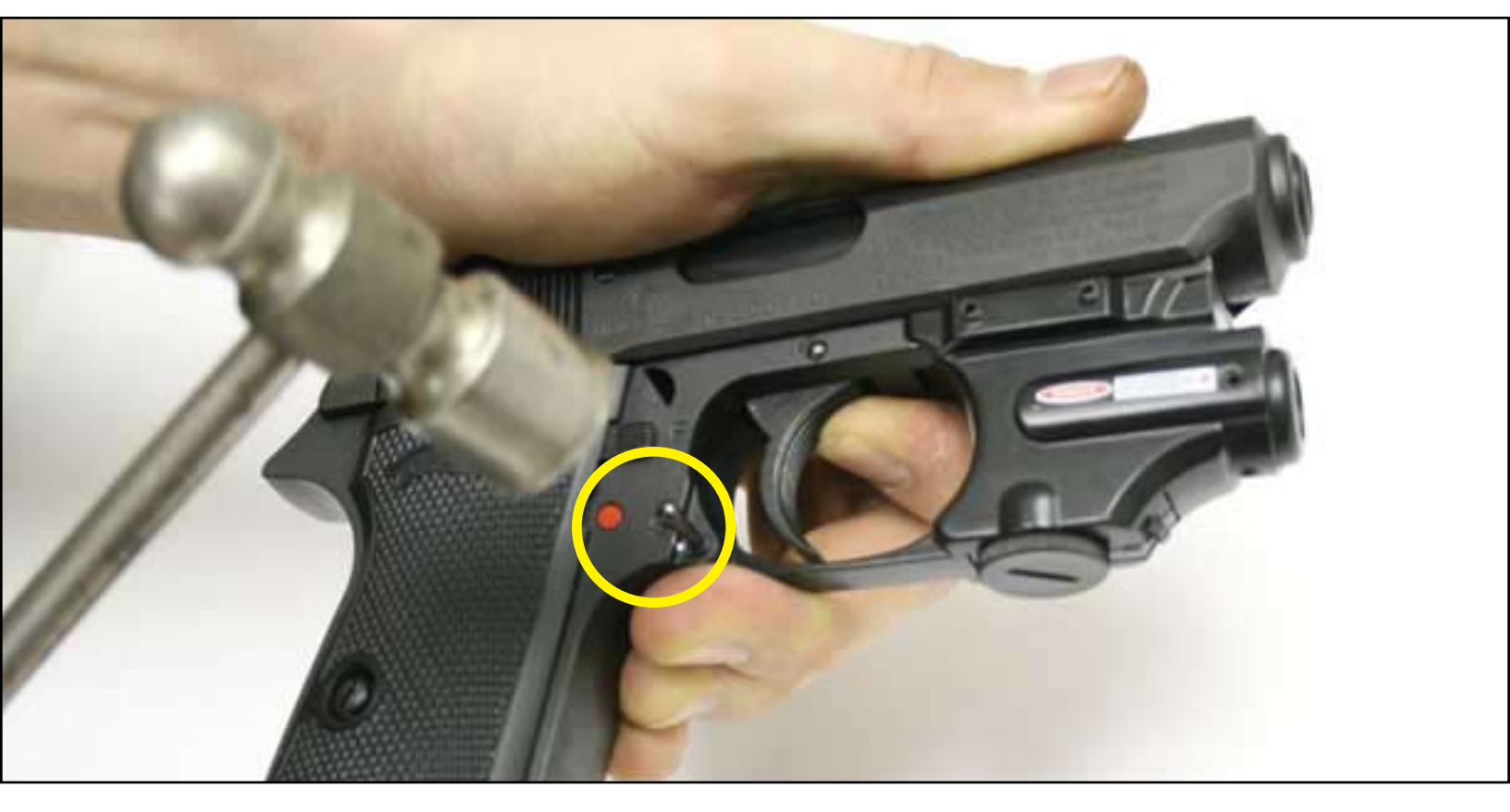
Step 5 Tighten the 2 small screws with the included hex key.