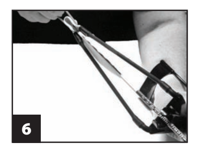
Step 6: Once the arrow is fully secure in the pocket then you are ready to take aim.