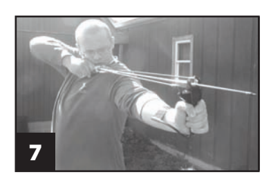
Steps 7 & 8: To aim, pull the Paracord loop to full extension as shown in pictures #7 & #8 and site in your target by looking down the arrow shaft. Once you have your target sited then release your finger from the Paracord loop.