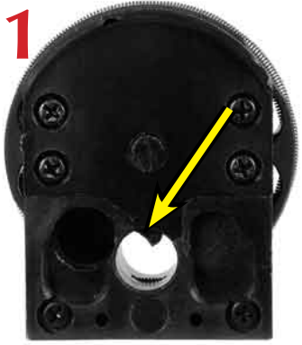
Image 1: When you load your magazine, the center hole may have a small black tab hanging down into the hole (arrow). If it does, go to step 2.

(As the rifle fires, the mag unwinds clockwise, bringing the next pellet in line with the bolt.)