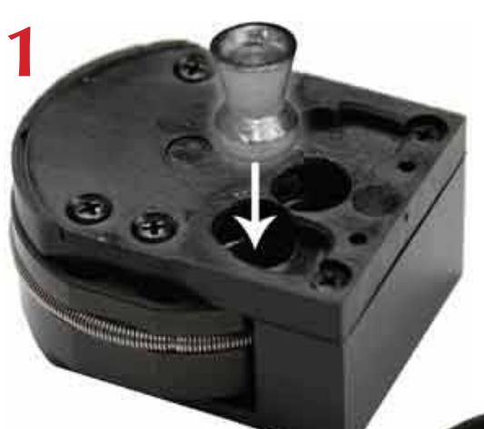
Back of mag shown. You'll be inserting pellets into the hole on the lower left, as shown by the arrow.

Your rifle comes with two magazines: .177 cal.=13 rounds per mag .22 cal.=11 rounds per mag .25 cal.=10 rounds per mag 9mm=10 rounds per mag