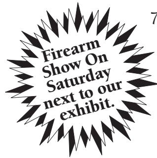
Table Fee Now $50